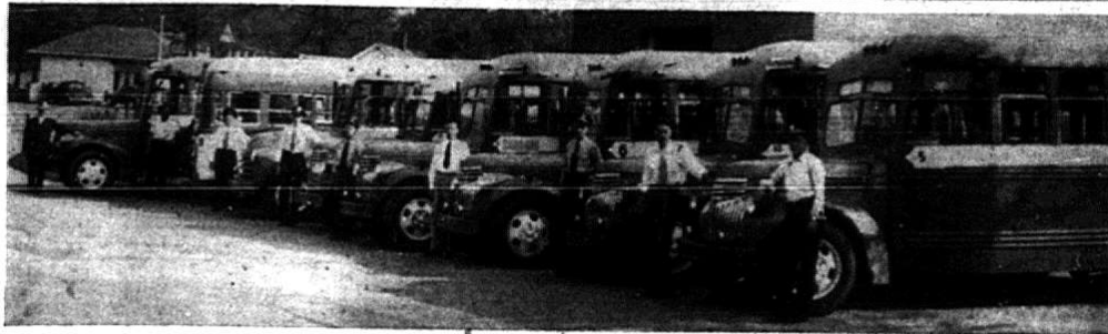
FLEET OF NINE BUSES SERVES LEAKSVILLE-SPRAY-DRAPER AND VICINITY